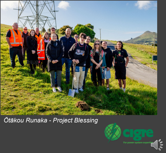
Ōtākou Runaka - Project Blessing