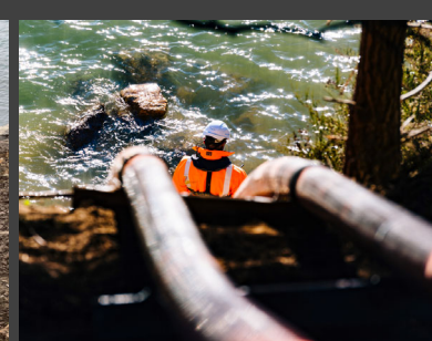
Ducting down the bank at Portobello