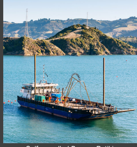
Self propelled Barge - Patiki

The depth profile of the cable route was very challenging at High Tide the maximum depth was 25m through the shipping lane and an had a minimum depth of 2m across the sand flats. At low tide these sand flats are clear of the water.