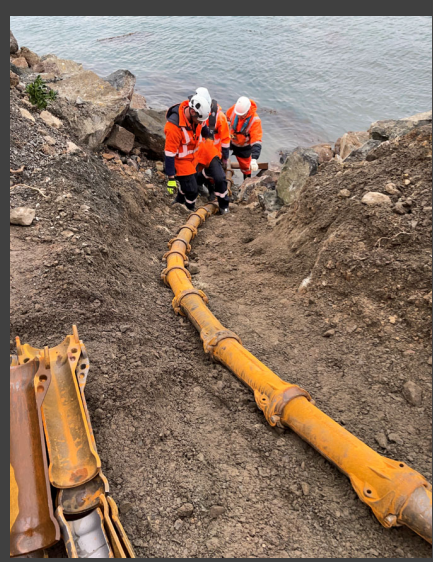
ProtectorShells – Port Chalmers