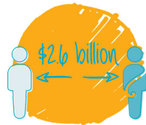
The current income gap for Māori is $2.6 billion per year