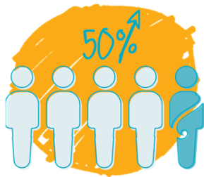
The Māori workforce will increase by 50% by 2038 – almost one fifth of the working age population

Our changing population demographics will see a younger Māori population needing to support future industries and fill the skill gaps left by an aging Pākehā workforce heading into retirement.