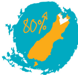
The Māori population in the Ngāi Tahu takiwā is set to grow by 80% by 2040