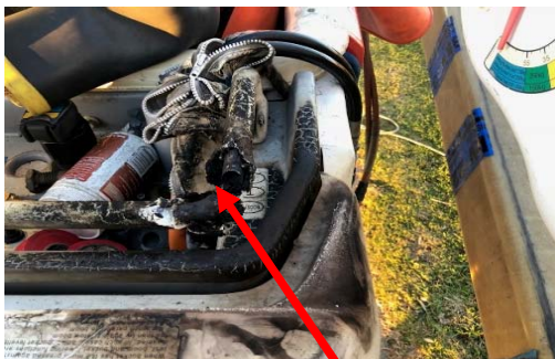
Protection bar over EWP control panel and arc point